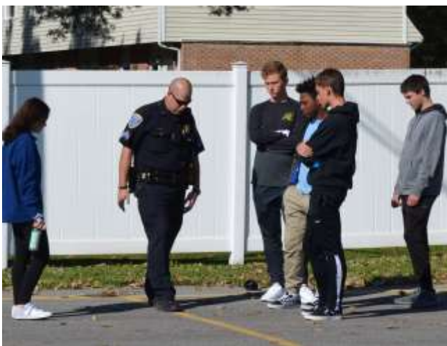
Students being briefed before their drive