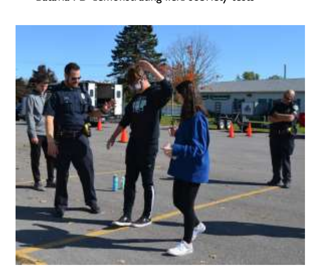
Students performing field sobriety tests