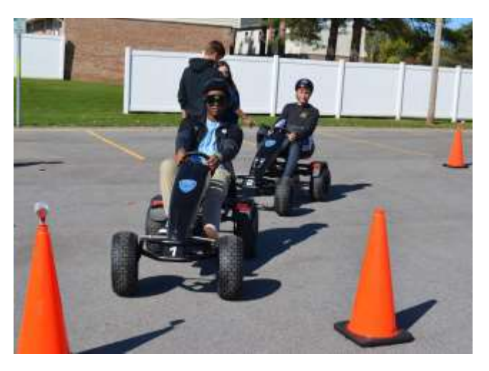
Students testing their driving abilities